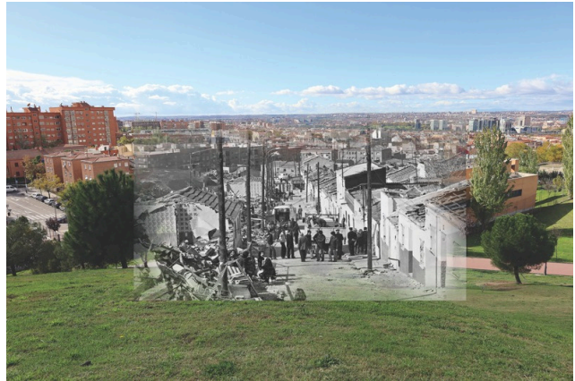
Image of the dismantlement of the illegal and historic settlements in Puente de Vallecas District, which once housed more than 10,000 people. The programme to eradicate shanty towns in the 1980s led to the creation of the current park known as «Siete Tetas». Beneath its distinctive hill lie the remains of those old self-built dwellings, transforming a site of neighbourhood struggle into one of Madrid's most iconic viewpoints.