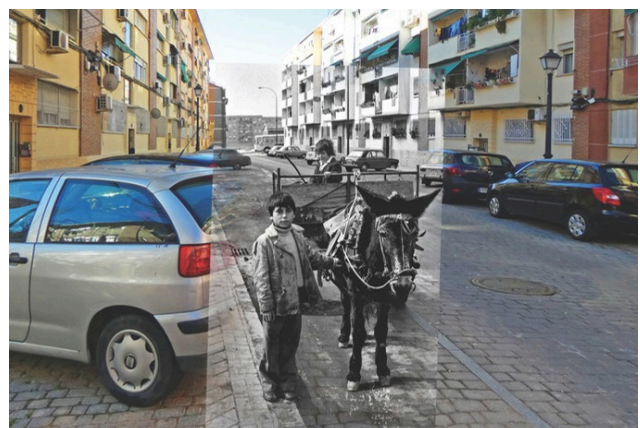
Photograph in B&W: Andrés Palomino Salazar.

Two children carried scrap in a donkey-drawn cart along Álora Street, in Palomeras Sureste. The image offers a stark portrayal of living conditions in Puente de Vallecas in the mid-1970s. Taken by Andrés Palomino Salazar—a local resident and visual chronicler of La Transición—the photograph documents a human and urban landscape that has now disappeared after the major redevelopments of the late 20th century.